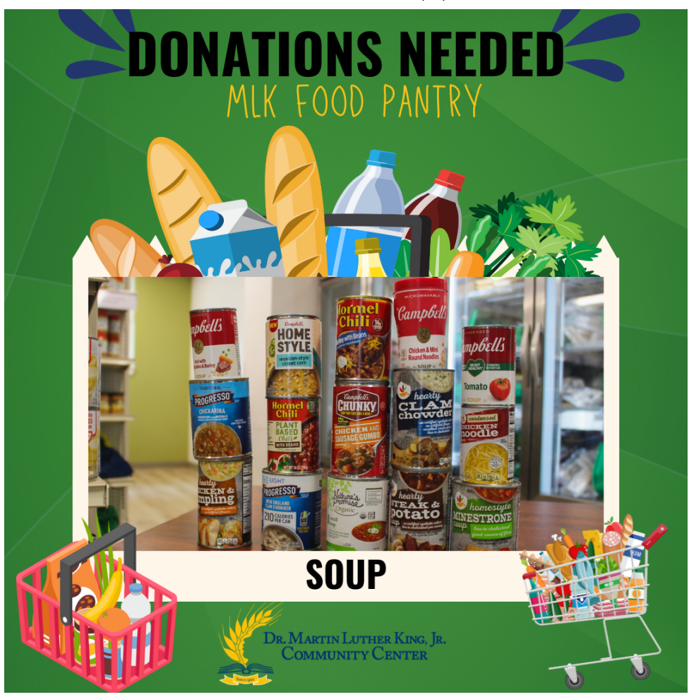
Give to the Food Pantry

Beep! Beep! Here Comes the Mobile Food Pantry!