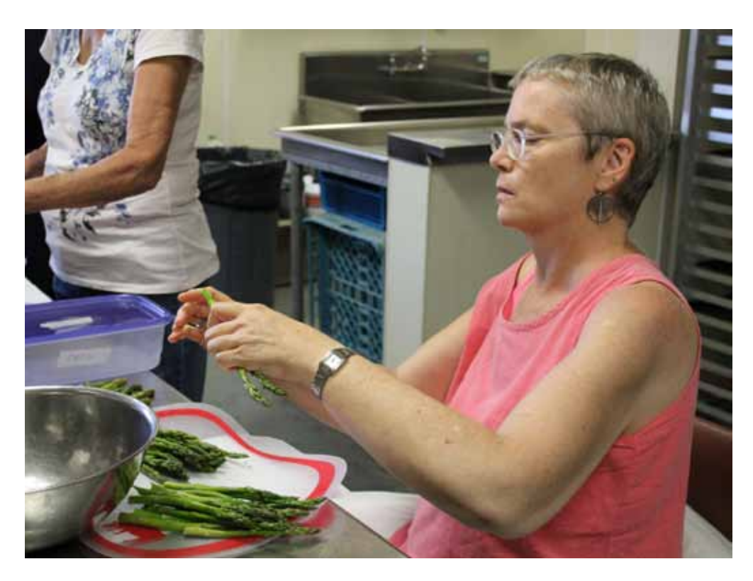
'I grew up in Jamestown but I've lived in Newport since 1991. I'm 53. I can't work because I've been disabled for many years.

My friend told me about the MLK. I knew there was a food pantry but I had no idea how many choices there were and how much healthy food there was.