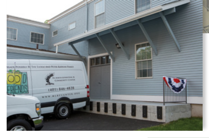
AFTER: A new loading dock on Dr. Marcus F. Wheatland Blvd. is the dedicated point for food donations and deliveries, relieving congestion inside the building and traffic on Tilden Ave.

BEFORE: Food deliveries and donations congested the halls and the old entrance on Tilden Ave, which often blocked traffic and caused clients to wait outside in adverse conditions.